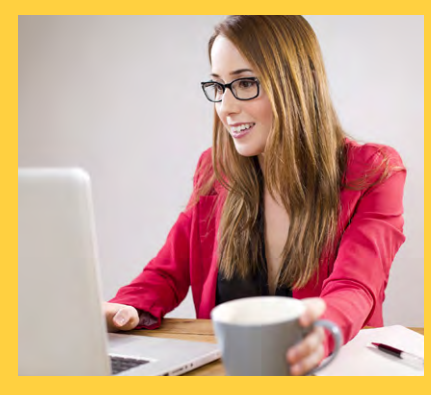
Attend instructor-led classes for an interactive learning environment with your classmates.